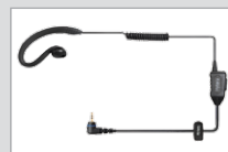
Earphone with C-clip EHS16