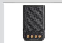
Lithium-ion battery (2000 mAh) BL2010