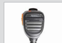
Speaker microphone SM26M1