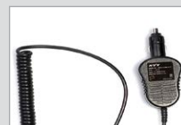
Vehicle power adapter for charger CHV09