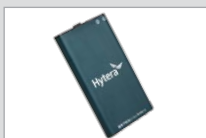
Lithium-ion battery (2000 mAh) BL2009