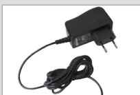
Switching power adapt- er for charger PS1018