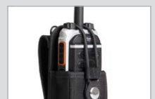
Carrying case (nylon) NCN011