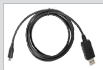
Programming cable (USB) PC69