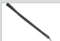
Hand strap RO03