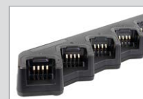
6-unit charger MCA08