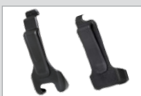
Belt clip BC20/BC 21