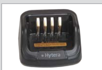
Voltage supply unit for charging cradle CH10A07