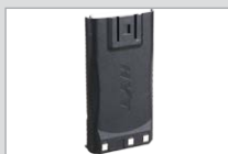
Lithium-ion battery (1500 mAh) BL1502