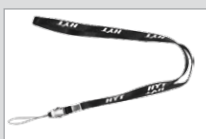
Hand strap RO01