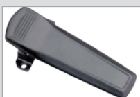
Belt clip BC19